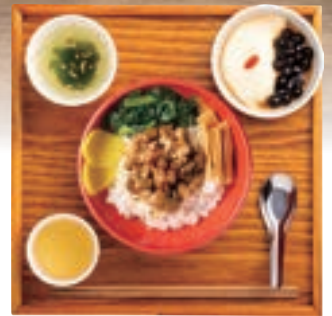
Braised pork rice set meal 1,280

(soup • selectable mini desserts • weekly Taiwanese tea with free refills)