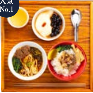
台灣滿意套餐 僅限內用