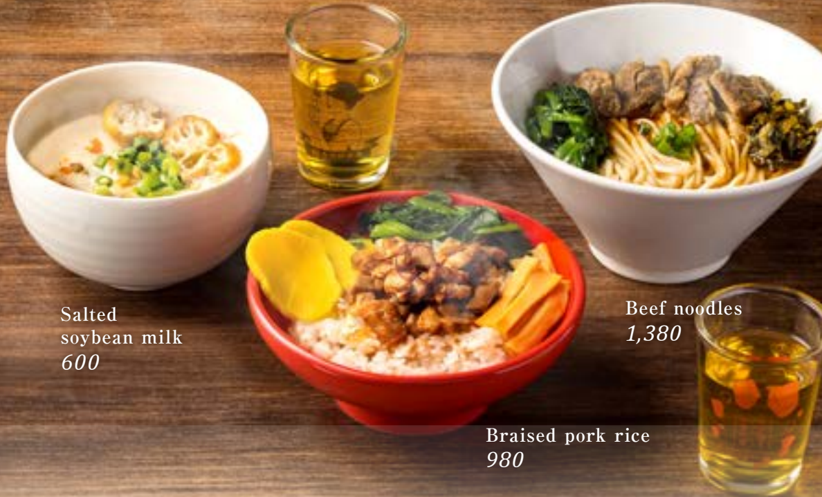
Salted soybean milk 600