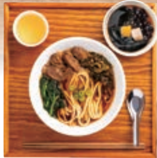
Beef noodles set meal 1,680

Value set meal with beef noodles and braised pork rice