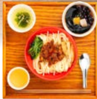
Soupless noodles set meal 1,280

(soup • selectable mini desserts • weekly Taiwanese tea with free refills)