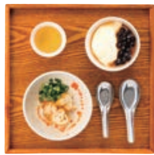
Salted soybean milk set meal 900

Value set meal with salted soybean milk and braised pork rice!